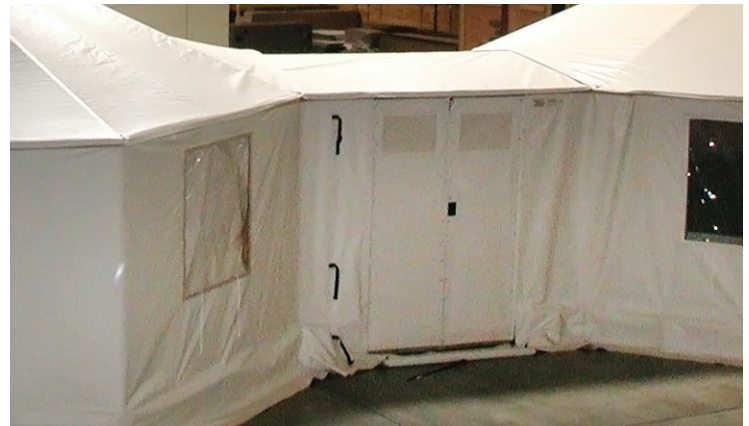
Vestibule Connector with double doors installed