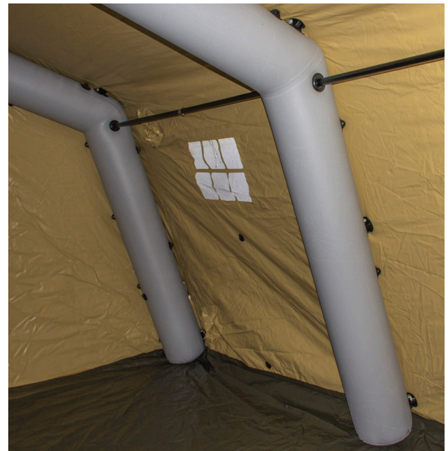
An interior view of the Sentinel II shelter system.

Beds, work stations, tables, seating and food prep